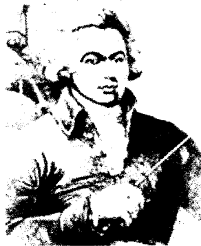
Joseph Boulogne Chevalier de Saint-Georges ca 1745-1799

Florence Price, The Women's Philharmonic (Koch) Symphony No. 3, The Oak, and the Mississippi River Suite are by Price.